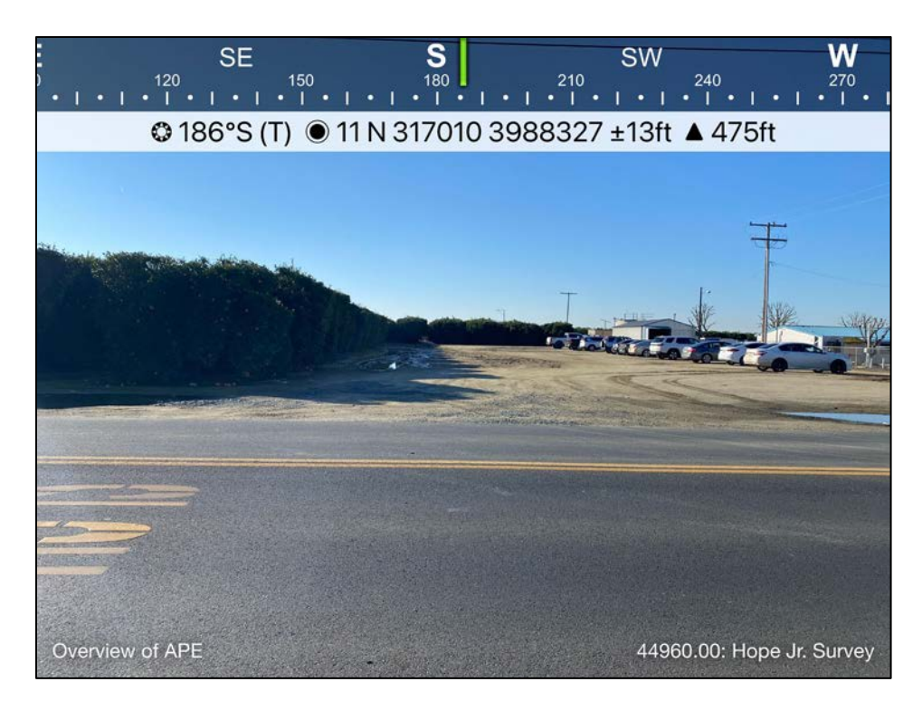
Figure 3. Project study area corridor overview, facing south.