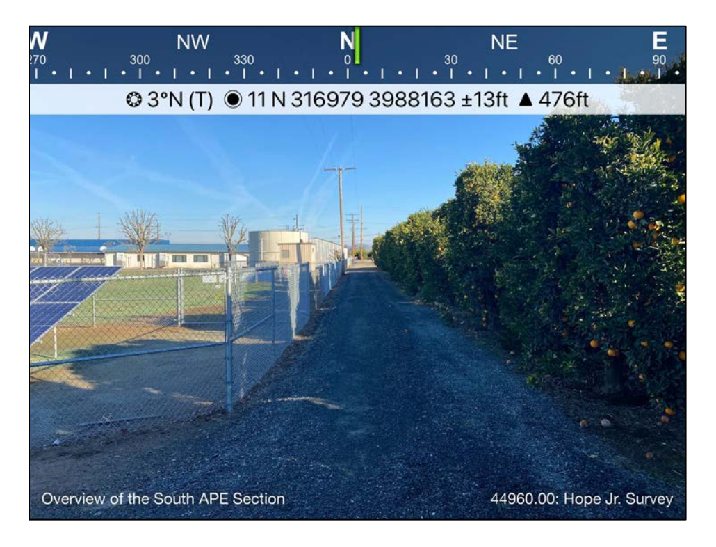
Figure 4. Project study area corridor overview, facing north.